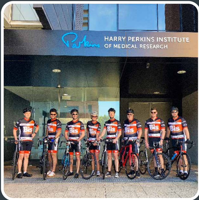
Training ride to the Perkins Institute